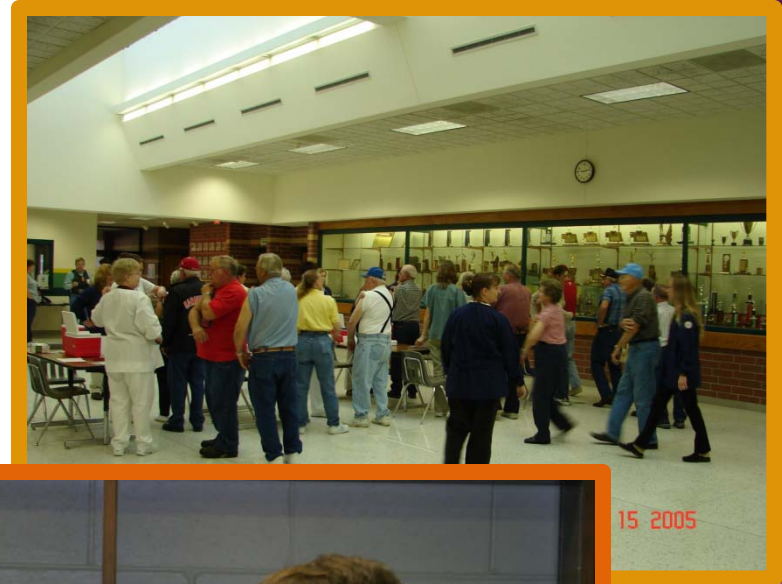
Central District Health Dept Mass VX Exercise