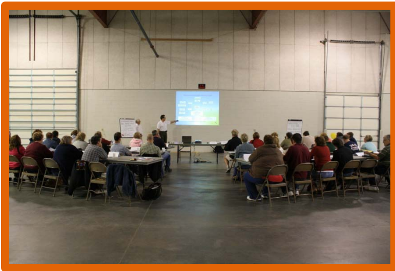
2009 Mass Fatalities Training with International Mass Fatalities Center