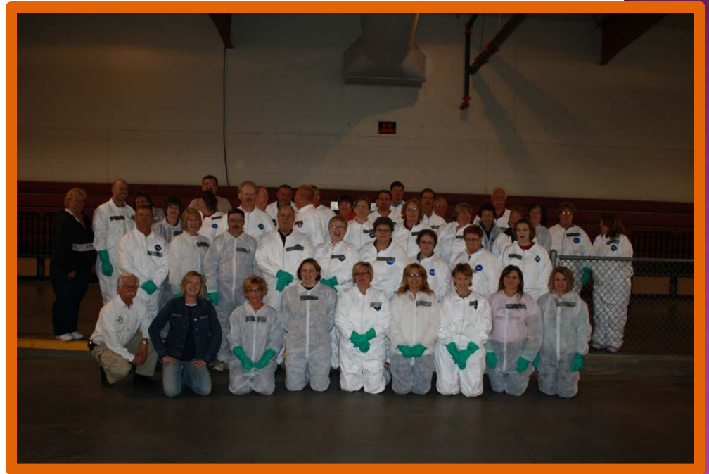
Mass Fatalities Training, 2009