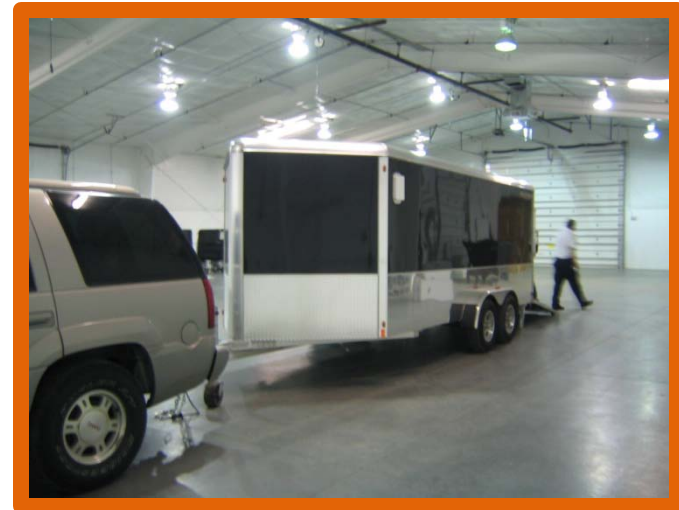
Mobile Medical Assets